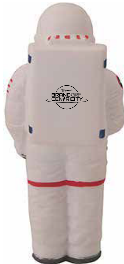
2" x 4.5"