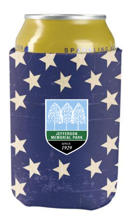
Graphic is for placement only Not to scale

The blue box in the previous proof was just there to cover the logo in the photo. The stars are part of the I Love USA design of the Koozie