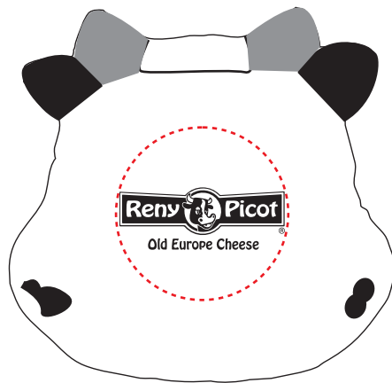
Milk Cow Face Stress Ball Item # 1008-100800 Pad Print on the Back of Head: Black

Note: some of the small, tight details in the cow face in your logo might bleed together and fill in when printed