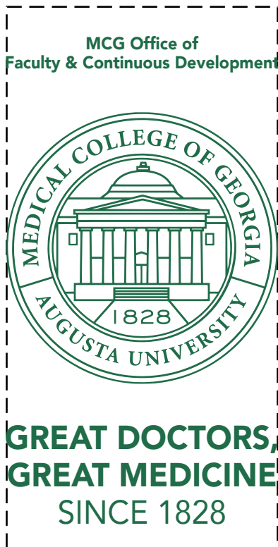
2" x 4" front & back (HEAT TRANSFER)

Actual Imprint Size: 2"W x 2.8"H (Notebook), 2/75" Wide on Pens