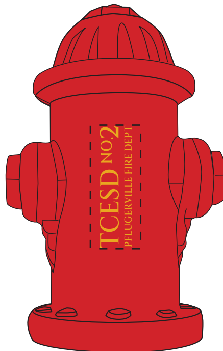
Actual Size of Imprint Dotted Lines Do Not Print