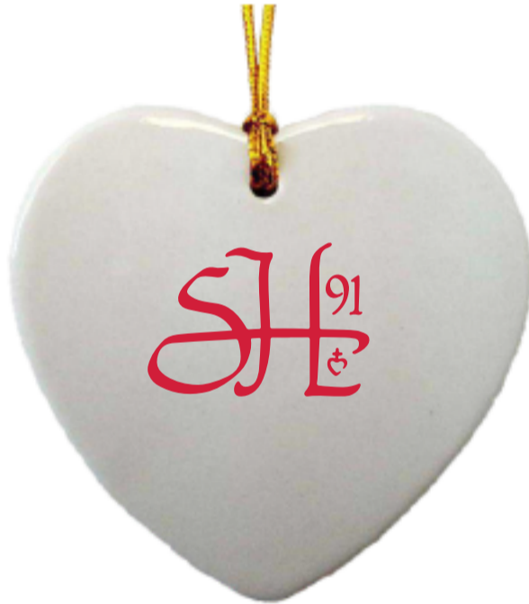
Actual Size of Imprint Dotted Lines Do Not Print

Imprint Method: Screen Print on the Front : Red 186