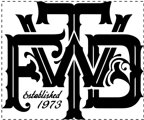
Actual Size of Imprint Dotted Lines Do Not Print