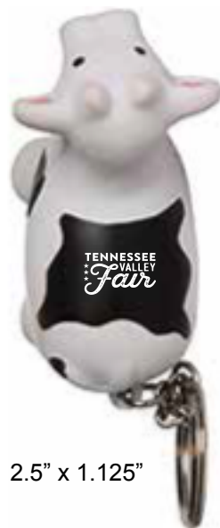
2.5" x 1.125"

Note: The artwork with the guitar is too detailed and will not work in this tiny imprint space. For this reason, I'd recommend using the simpler version of your logo as shown below